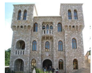
CASTLE OF PATRICK AND NANCY LATTA

You will receive your travel documents approximately three weeks before departure Cancellation fees are: 90 to 61 days before departure date..... $1200.00 60 to 31 days before departure date..... $1800.00 30 days to 1 day before departure or no show.....no refund