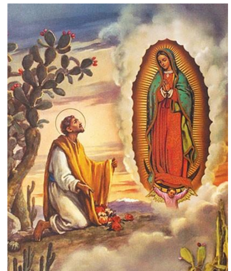
"Am I not here, I who am your Mother?" Our Lady of Guadalupe

You will receive your travel documents approximately three weeks prior to departure Cancellation fees are: 90 to 61 days before departure date..... $450.00 60 to 31 days before departure date..... $350.00 30 days to 1 day before departure or no show... no refund