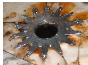
Place of Jesus' Birth in Bethlehem

You will receive your travel documents approximately three weeks before departure