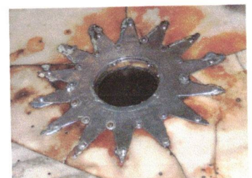
Place of Jesus' Birth in Bethlehem