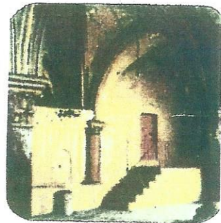
Last Supper Room

To make reservations: Please complete the form below and with your check payable to Ave Maria Pilgrimage send to: Ave Maria Pilgrimage, 35 Mallorca, Laguna Niguel, CA 92677 For more information call 949-249-2500 or 949 223-3970 or email at LiveTheMessage@gmail.com