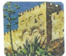
The Golden Gate