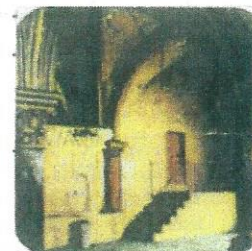
Last Supper Room