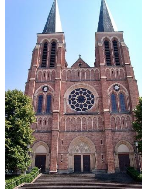
SACRED HEART OF JESUS CHURCH