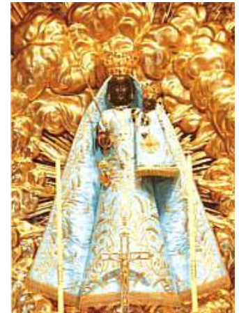
Black Madonna of Einsiedeln

Cancellation fees are: 90 to 61 days before departure date..... $1200.00 60 to 31 days before departure date..... $1800.00 30 days to 1 day before departure or no show..... no refund