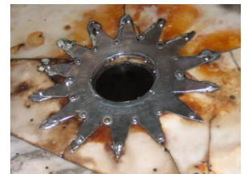
Place of Jesus' Birth in Bethlehem

You will receive your travel documents approximately three weeks before departure